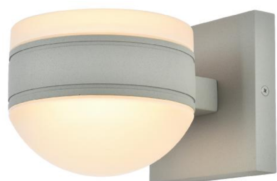
Silver Item No:LDOD4017S