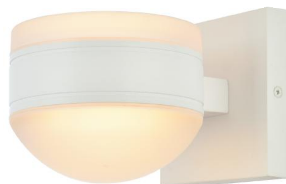
White Item No:LDOD4017WH